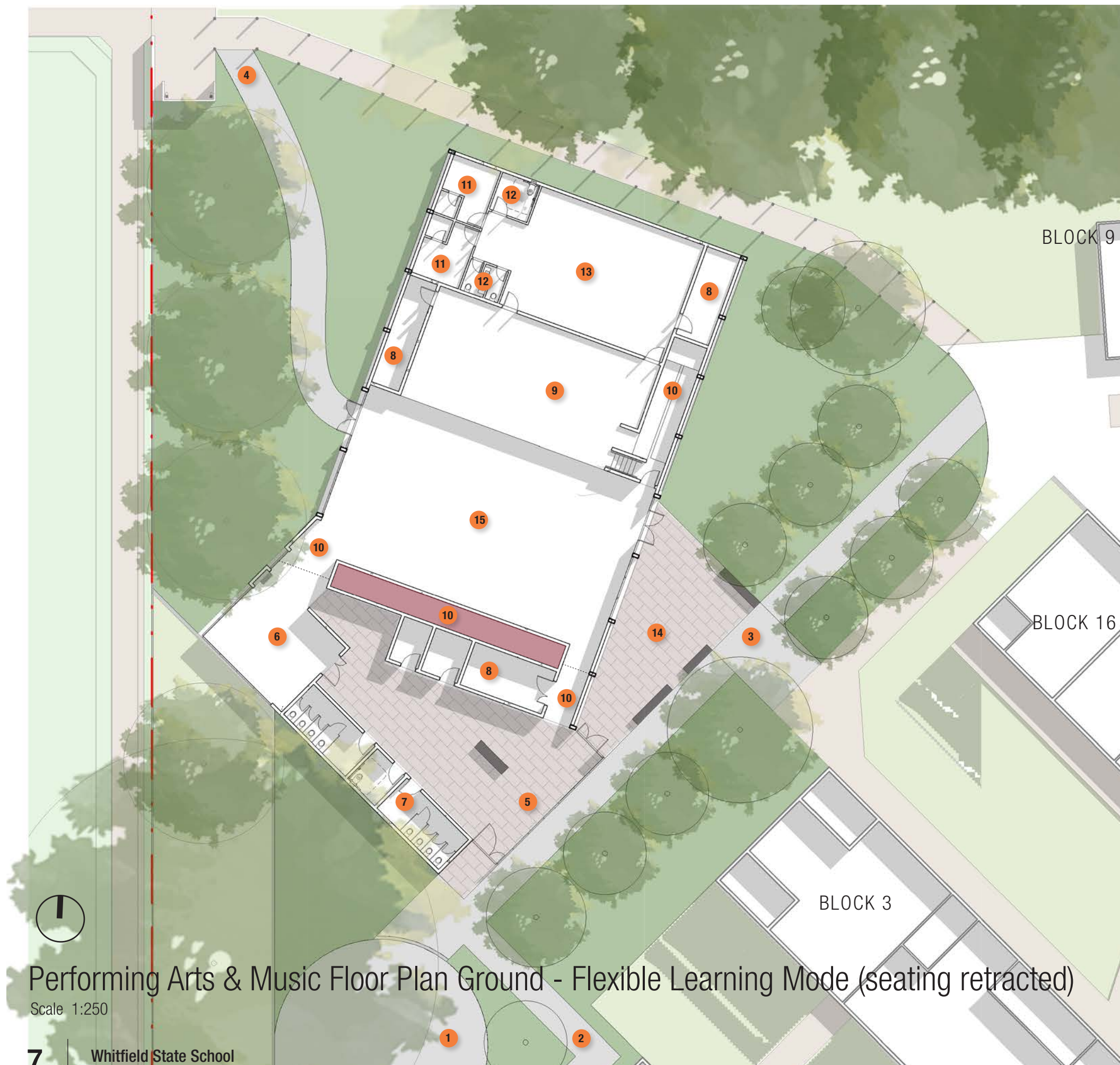
Performing Arts & Music Floor Plan Ground - Flexible Learning Mode (seating retracted)